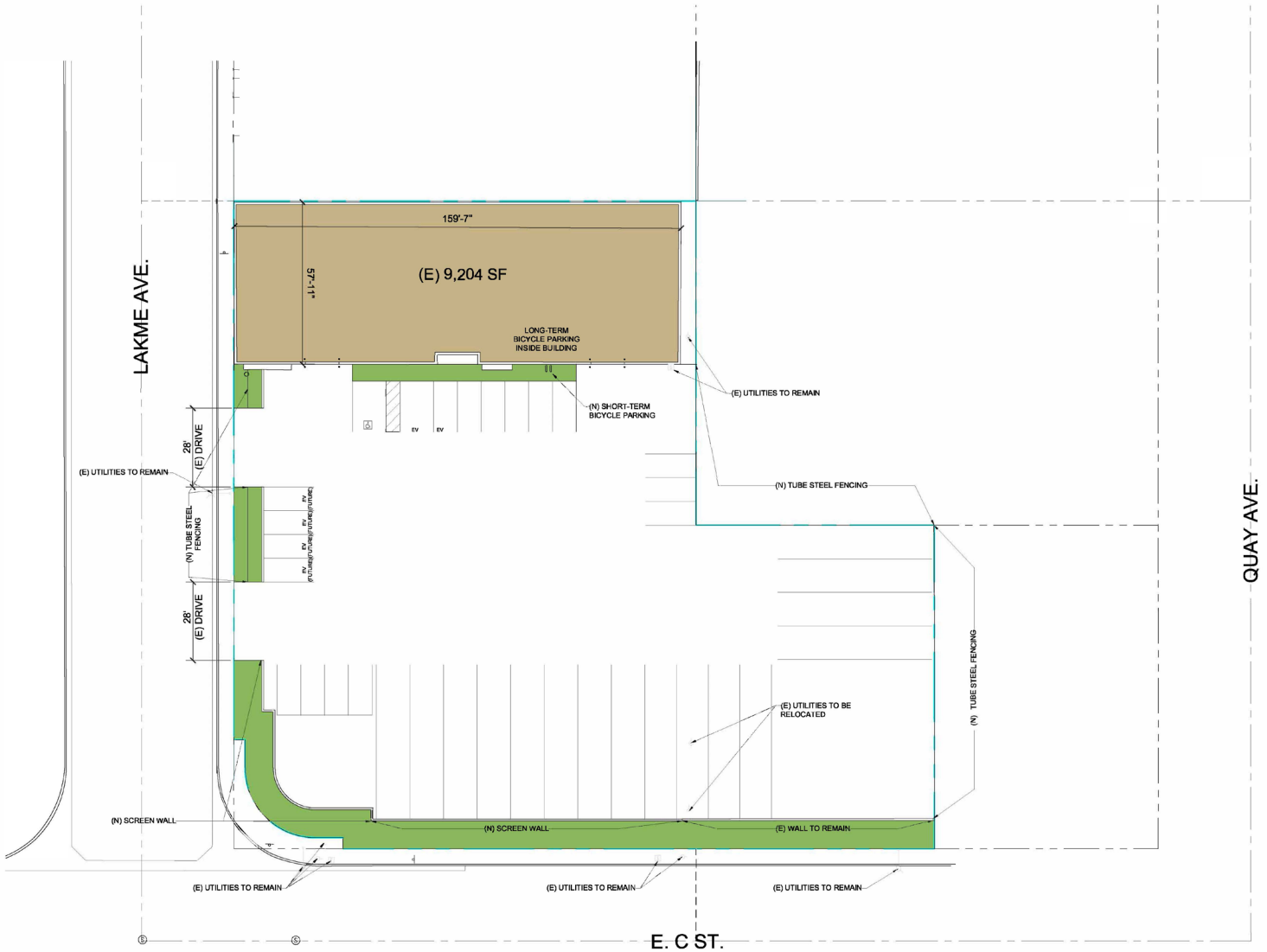
A CONCEPTUAL SITE PLAN SCALE: 1" = 20'