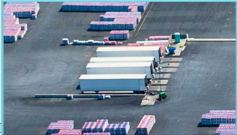
6 dock height loading positions with hydraulic pit levelers built into the yard